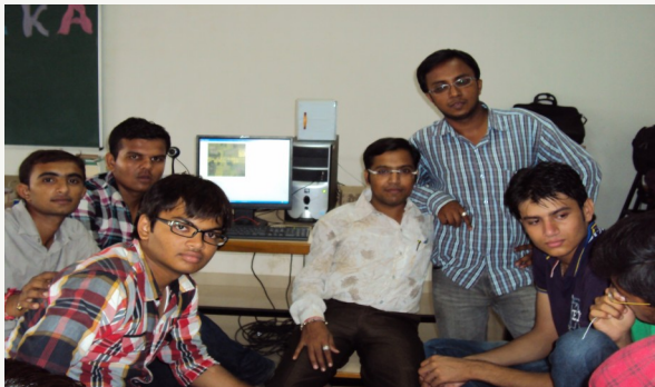
SRPEC Participants with their Model