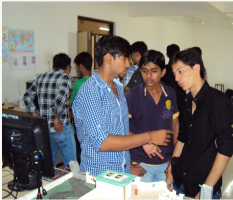
Students of SRPEC Explaining their Innovative idea for the presented Model during the Event ‘Frolic 2012’

Students from 7th Civil of Smt. S. R. Patel Engineering College (SRPEC) Dabhi, Unjha along with a supervising faculty participated in the “ Frolic 2012 – Technical Event”, during 31st August to 2nd September 2012, at Darshan Engineering College– Rajkot.