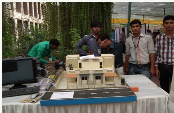
SRPEC Participants with their Model