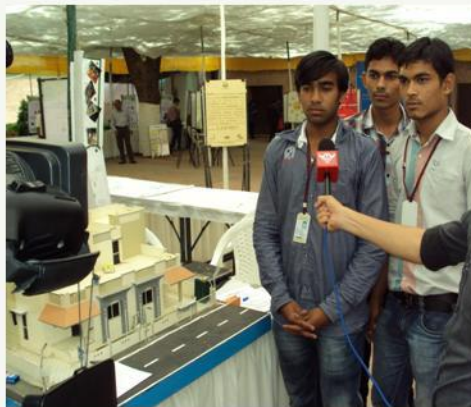
Students of SRPEC Explaining their Innovative idea for the presented Model during the Event 'Yuva Yantriks'

Students from 6th Civil of Smt. S. R. Patel Engineering College (SRPEC) Dabhi, Unjha along with a supervising faculty participated in the “The First National Innovation Competition of Young Technologists—Yuva Yantriks”, on 5th April 2012, at IIM – Ahmedabad.