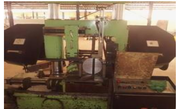
J H Engineering, Vatva

This type of industrial visit will be helpful for student for choosing best courses for their future up gradation of courses.