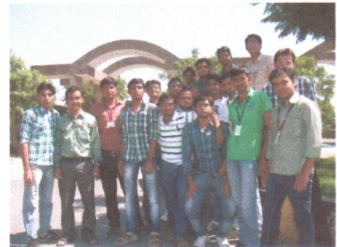
Banas Dairy, Palanpur,

courses for their future up gradation and by doing so they can implement their skills in many industries.